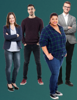
Questioning & Skeptical