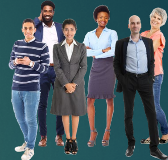
Accepting & Warm